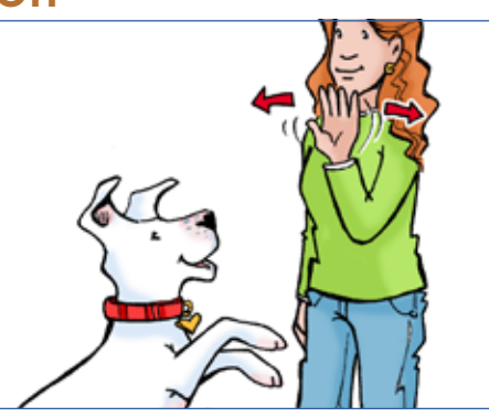
Hold your hand up with palm facing the dog and wave it quickly back and forth. The dog puts all four feet on the ground and keeps them there immediately on cue.