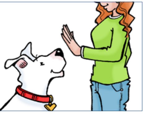
Flash your hand with palm facing the dog and fingers pointed up. The dog remains in the position you place her in until you release her.